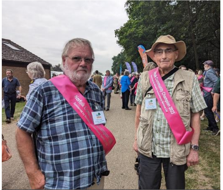
We may be getting on in age (yes I am the older of the two!!), but we can still put in a good day's work, although we may be good for nothing the following day!!