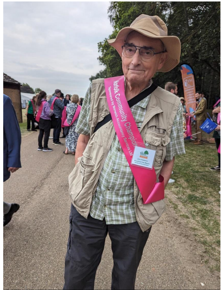
I got there in the end.

By the way. I didn't decide that we had to wear PINK sashes!!!