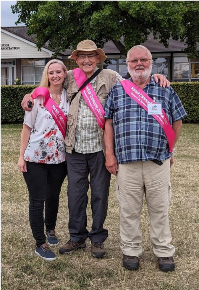
Proud to represent you all