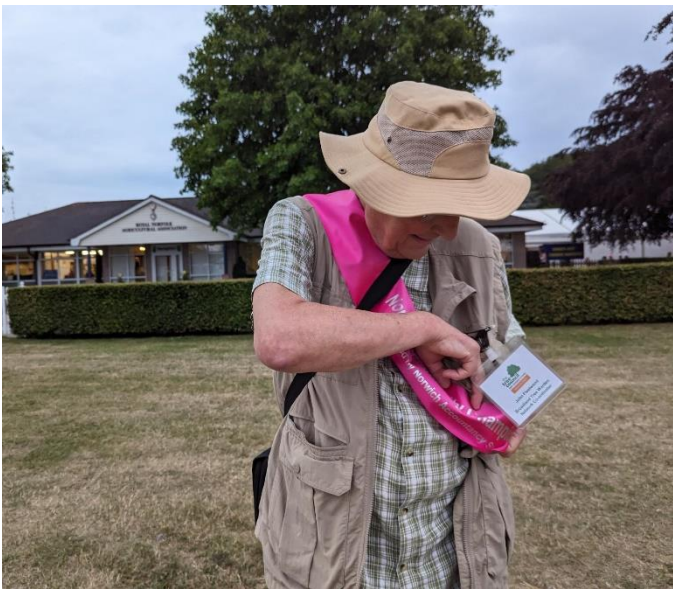
How am I supposed to get this sash to stay on?

By the way. I didn't decide that we had to wear PINK sashes!!!