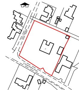
LOCATION PLAN 1:1250 @ A1

0m 10m 20m 30m 40m 50m 60m 70m 80m 90m 100m 110m 120m